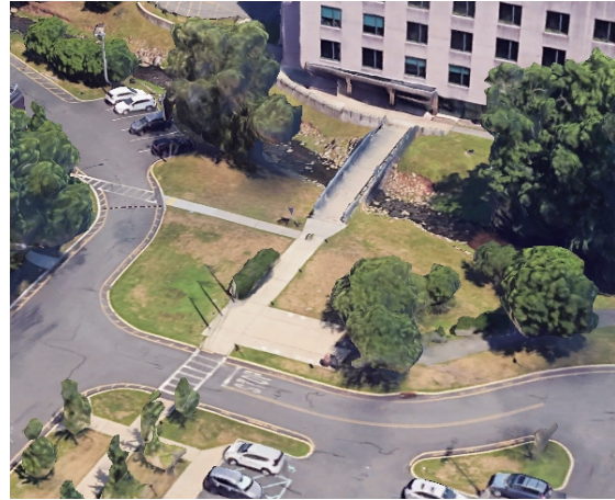
County Office Building Campus: 11 New Hempstead Road, New City, NY