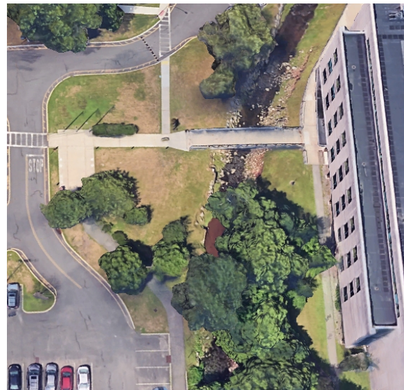
Project Site within the COB Campus

For more information about the AIPP completed projects visit: https://www.aiprockland.org/completed-project